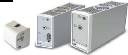
(92516) Capno Pod (92517) Capnography Module (92518) Multi-Gas Module

Spacelabs carries a variety of TruLink and brand name capnography supplies that have been validated for use with Spacelabs modules. For Sidestream and Mainstream monitoring, we offer a variety of low-cost but high-function adapters, cannula, sampling lines, sensors, and airway T-adapters.