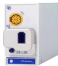
(91517) Dual Capnography Module

The legacy dual capnography module 91517 is now obsolete. However, Spacelabs will continue to carry TruLink and brand name cannula, sampling lines, and airway T-adapters for use with this module, while these parts remain reasonably available from the manufacturer.