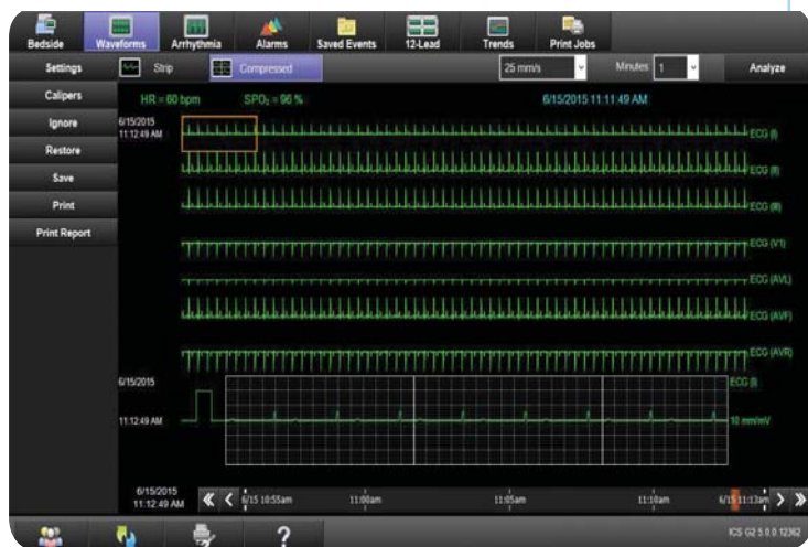
ICS shows 7-leads ECG from AriaTele