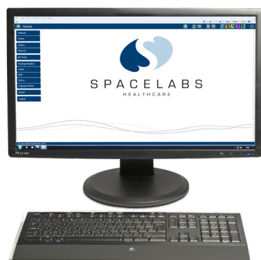
A Single PC